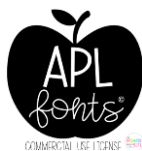
A Primary Kind of Life