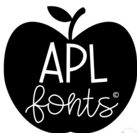
A Primary Kind Of Life