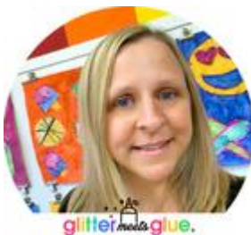
Glitter Meets Glue